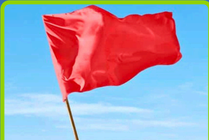
CAPTURE THE FLAG