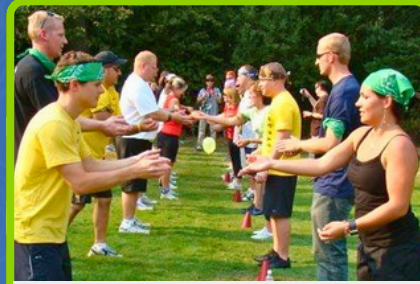
WATER BALLOON TOSS